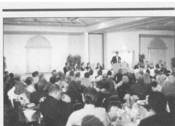
Health Care Breakfast where John addressed 600 professionals in Columbia.